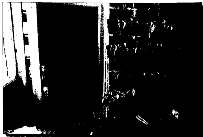
Reception of the district hospital in Rujewa - Mbarali District