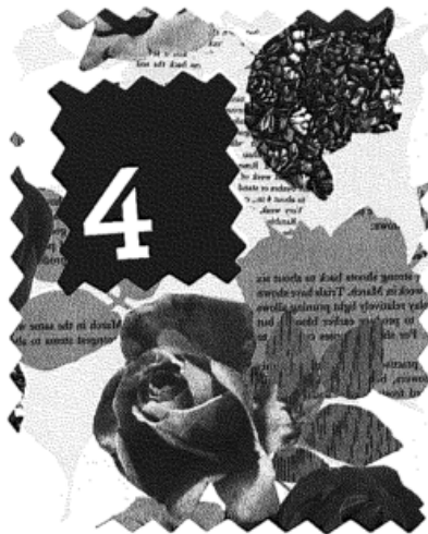
Vintage Floral Collage Melanie Bowles Page 46