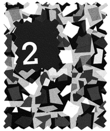
Post-Modern Play Melanie Bowles Page 24