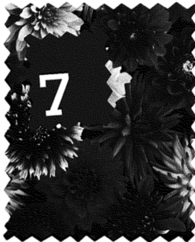
Dahlia Skirt Melanie Bowles Page 82