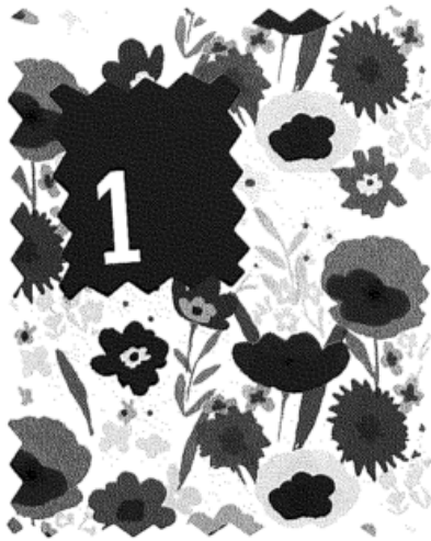
Paintbrush Floral Melanie Bowles Page 10