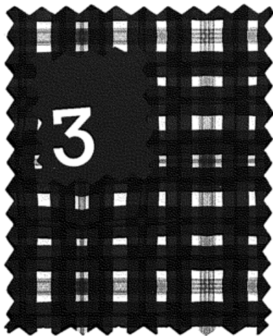
Easy Boy Check Melanie Bowles Page 36