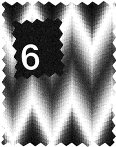
Bargello Dress Melanie Bowles Page 68