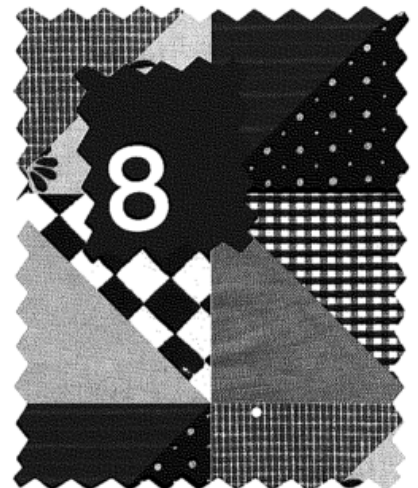
Clara's Patchwork Clara Vuletich Page 94