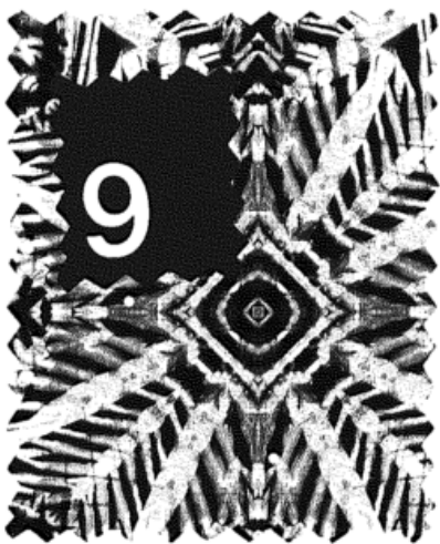
Digital Shibori Joanna Fowles Page 106