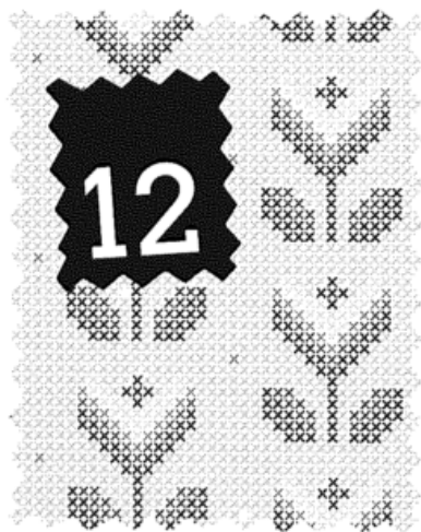
Stitched by Jane Jane Bates Page 136