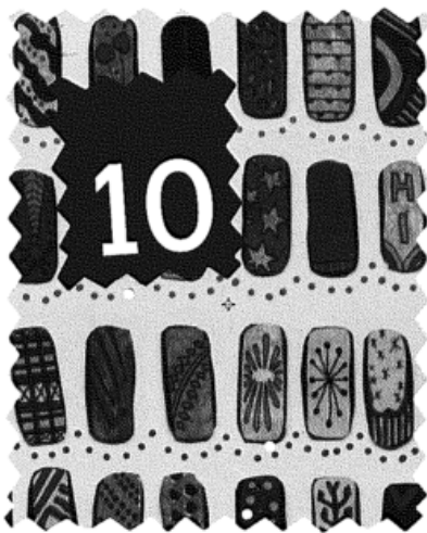
Colour Me In Nina Chakrabarti Page 118