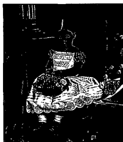
2 Daughters of Liberty 35