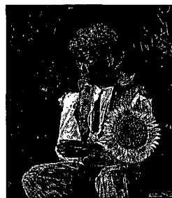
3 Children of Bondage 73