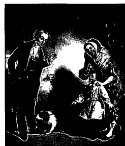
6 The New Scholar 179