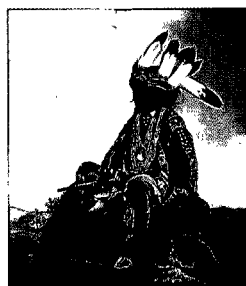
5 The Papoose 147