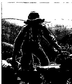
1 The Country Boy ii